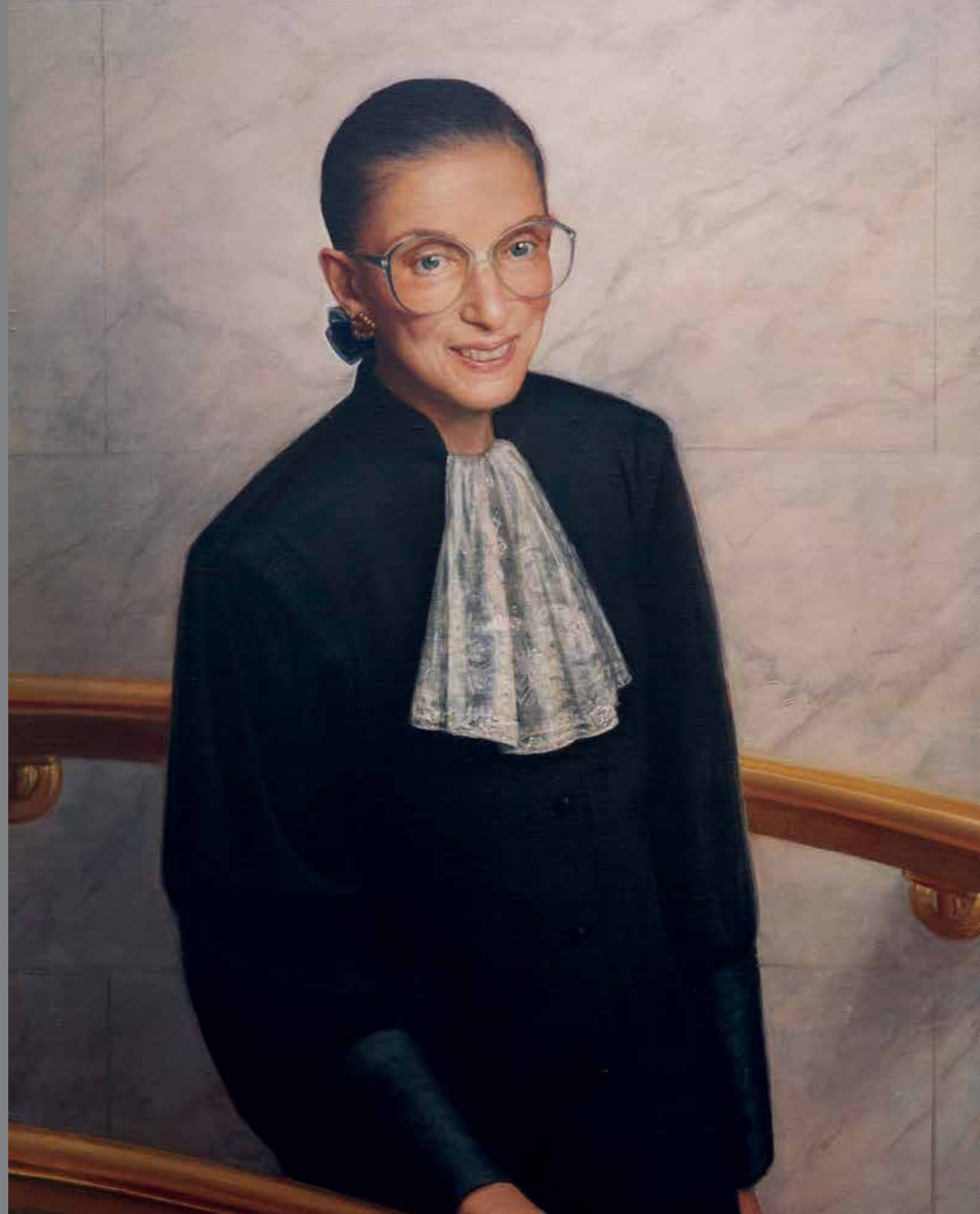
Columbia Law School's official portrait of Justice Ruth Bader Ginsburg '59, unveiled in 2001, painted by Constance P. Beaty.